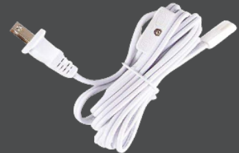
1 X 120 V POWER CORD PLUG