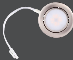
1X LED PUCKS WITH 1 WIRE