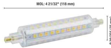
T3 - 118 mm