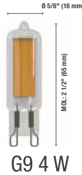
G9 4 W