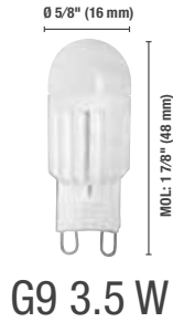
G9 3.5 W