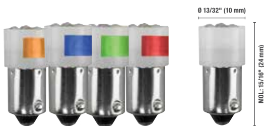
T-3 1/4 - 7 Cluster