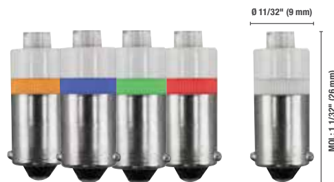
T-3 1/4 - Single chip