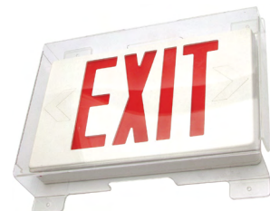
OPTIONS PG - Polycarbonate Guard