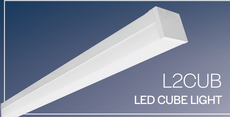
L2CUB LED CUBE LIGHT