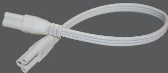
12" Linkable Cable Connector